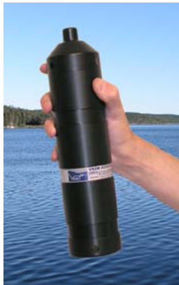
Approximate size of acoustic receiver equipment to be deployed. Further details can be found at http://www.thelmabiotel.com/tbr-700/