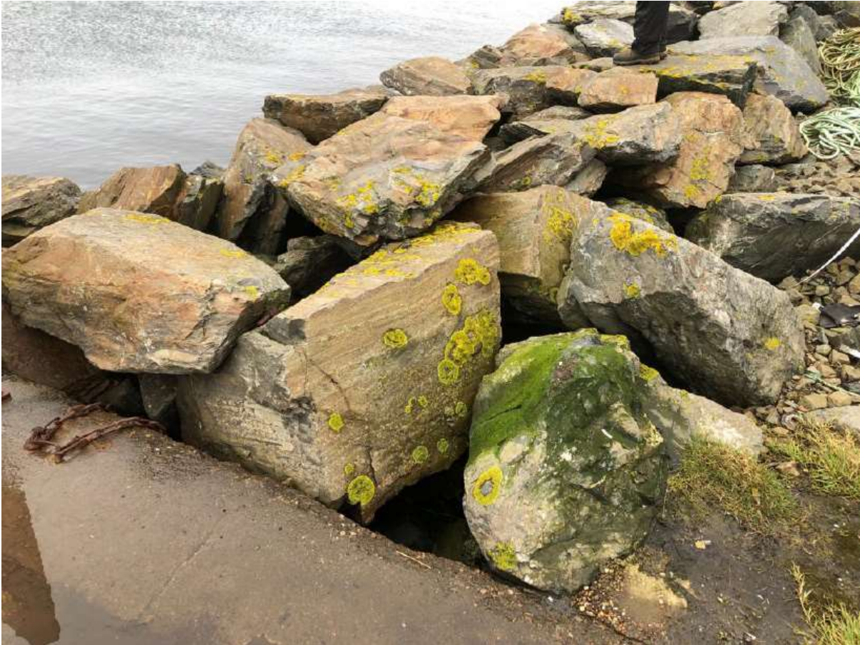
Figure 1 2: Active spraint site and potential holt site (not regularly used, if at all as a holt) [Redacted]