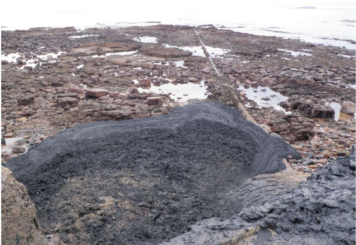
2010 Dredging Operations showing dredged material within inter – tidal zone (Morning of 02/02/10)