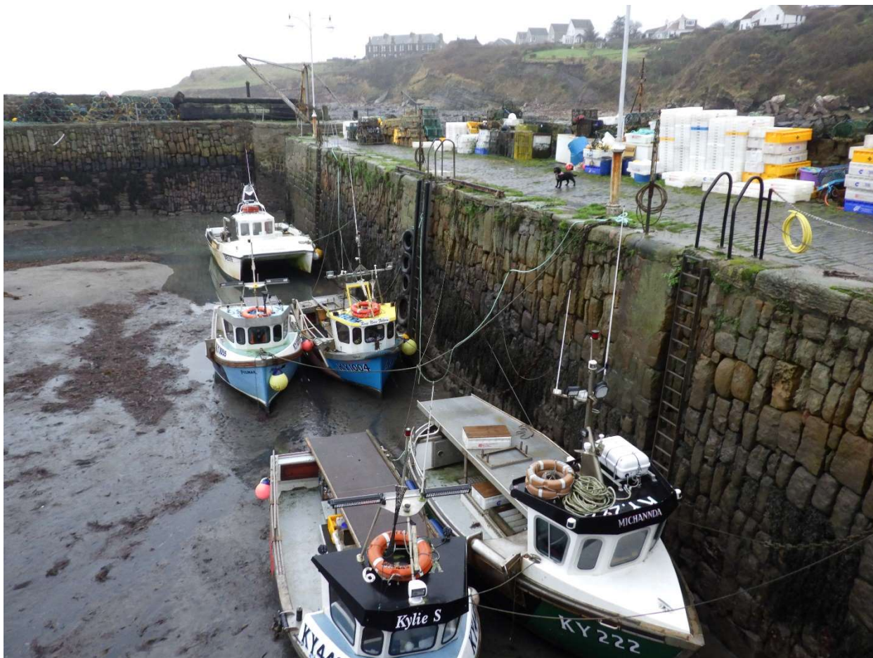
Crail Harbour – General View 2019