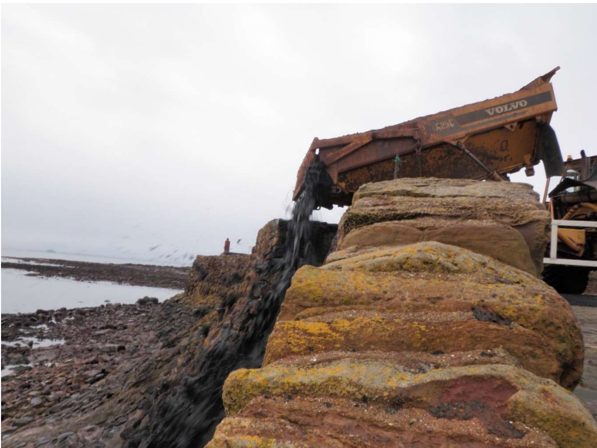
2010 Dredging Operations showing dumper tipping over lowered section of harbour wall