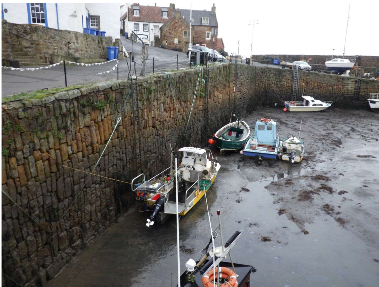
Crail Harbour – General View 2019