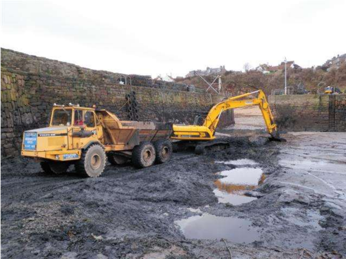
2010 Dredging Operations showing excavator and dumper working in Crail Harbour