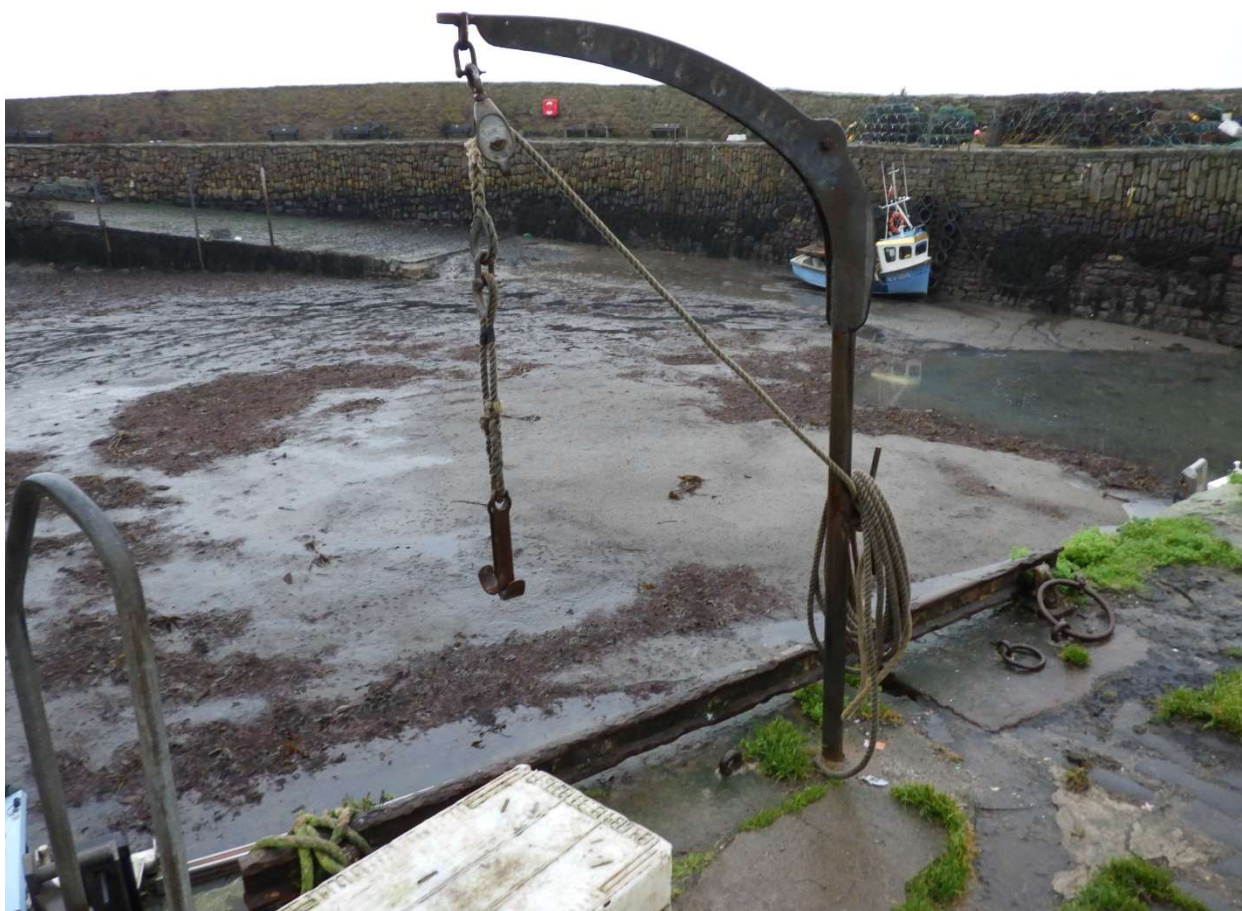
Crail Harbour – General View 2019