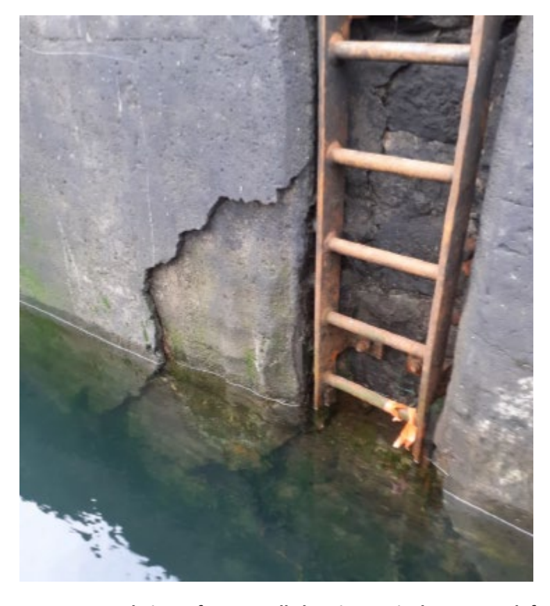
Photo 6 – General view of quay wall showing typical concrete defects