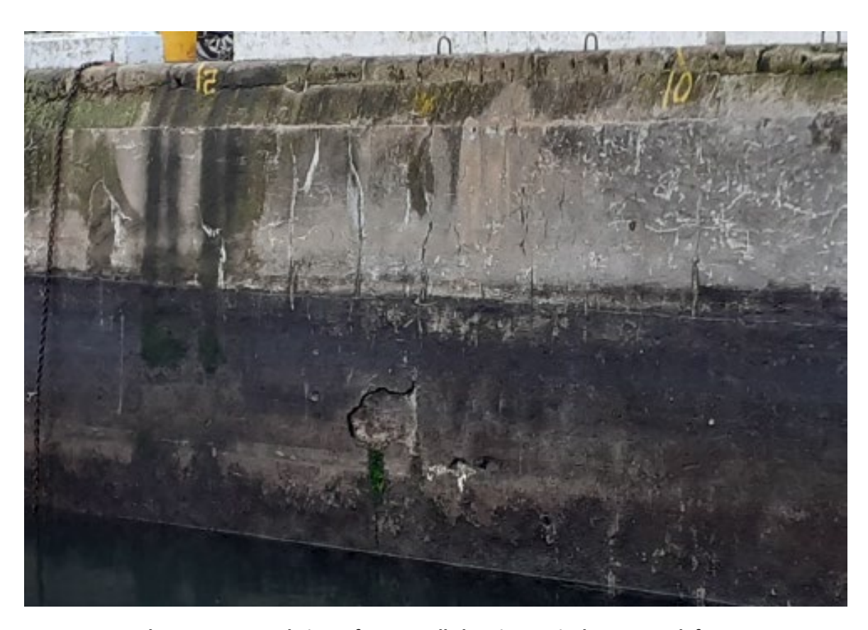
Photo 5 – General view of quay wall showing typical concrete defects