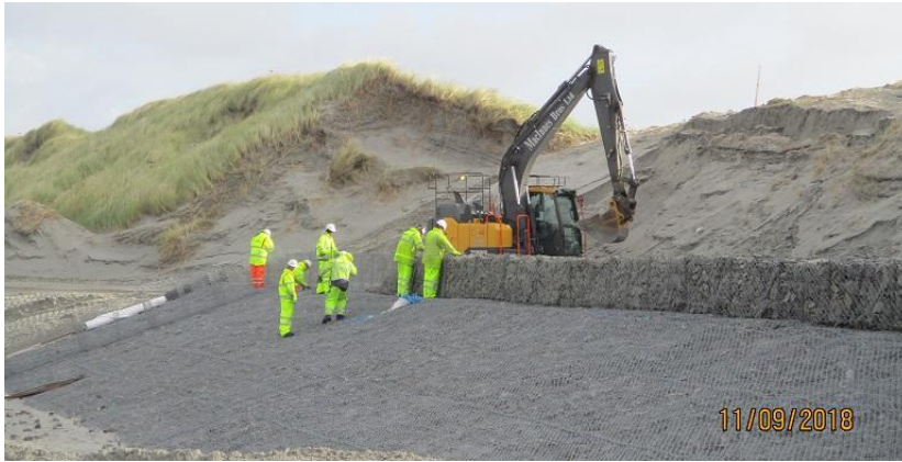
View from beach Sloping mattress and top edge basket just complete, before beach sand naturally washes back over