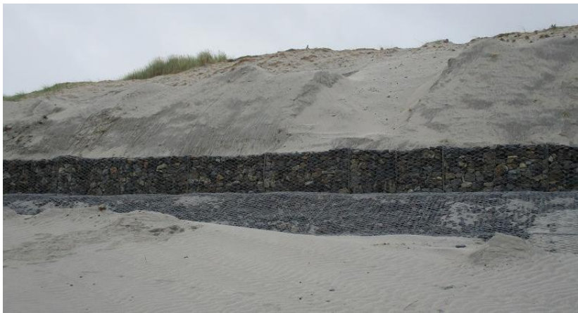
View from beach Beach starts to wash back over mattress Dune face above, just before reinstatement and placing of picket fencing