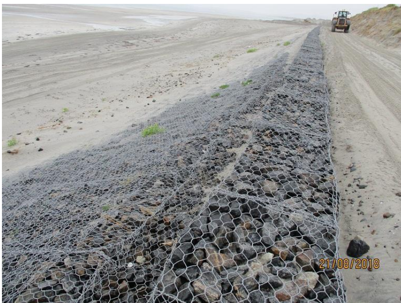
View top of defence Mattress and Basket complete. Shows construction strip behind the defence prior to dune face being reinstated Dune face reinstatement comprises returning sand to reform face to natural lines, insertion of picket fencing to stabilise and the planting of marram grass tufts saved in the original excavation