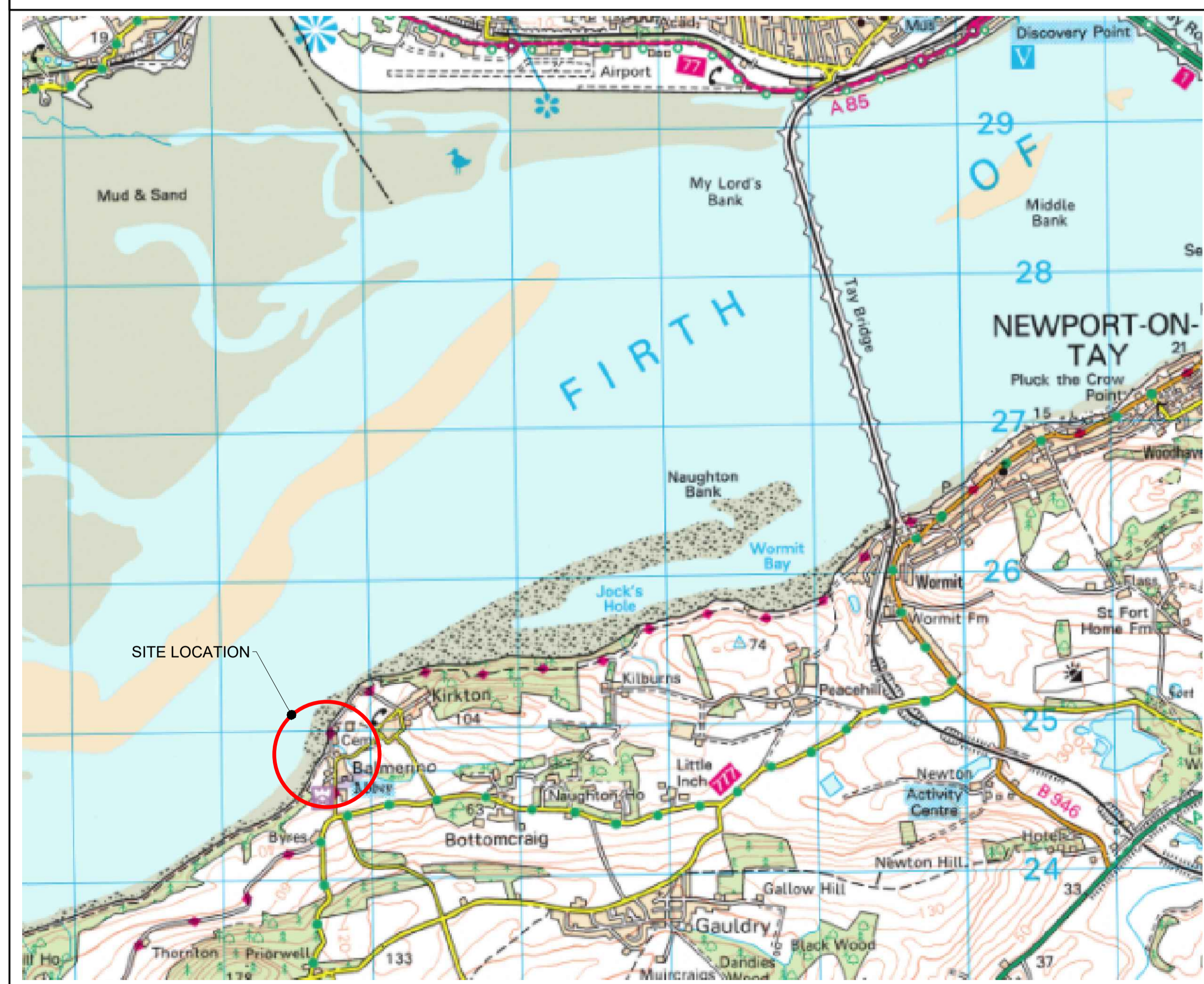
LOCATION PLAN SCALE 1:25,000