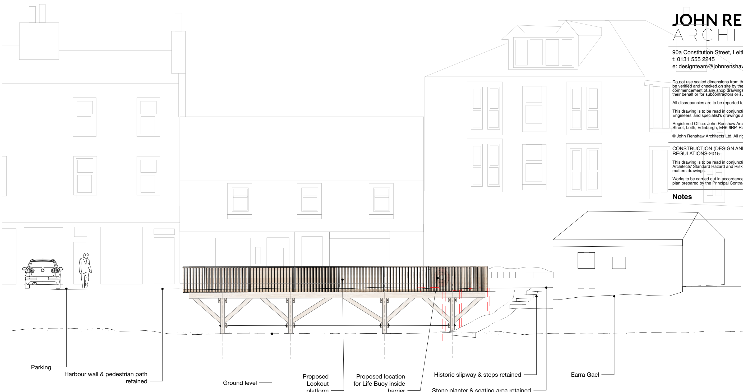
1 Proposed North Elevation Scale: 1:100