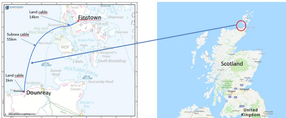
Figure 1-1: Project Description

The Orkney Islands represent a major source of renewable electricity potential, and its new connection to the mainland will help decarbonise the UK's electricity production and also secure a better transmission infrastructure between the Scottish mainland and Orkney.