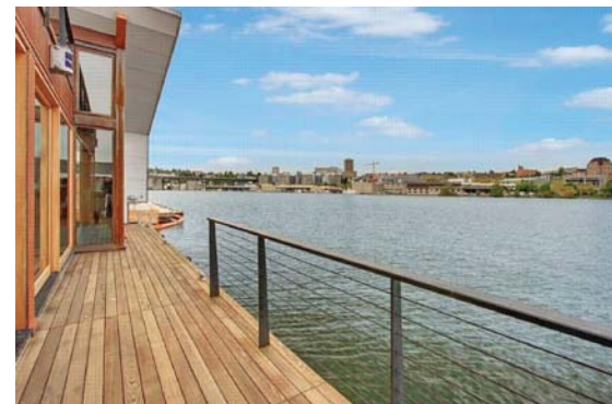
FWD. DECK CONCEPT