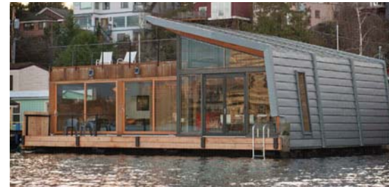
FWD. FACE CONCEPT