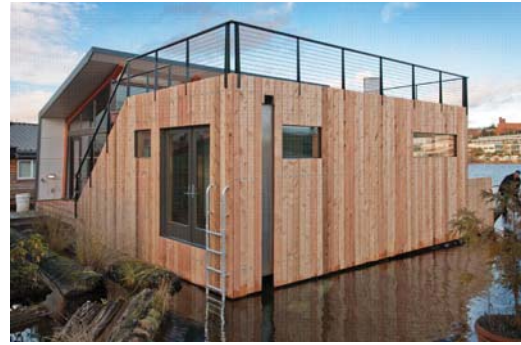
AFT / STBD. FACE CONCEPT