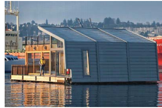
FWD. / PORT FACE CONCEPT