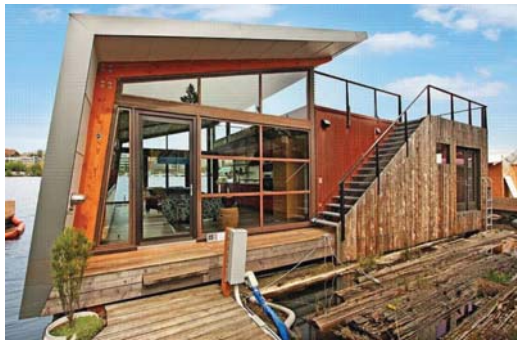
AFT FACE CONCEPT