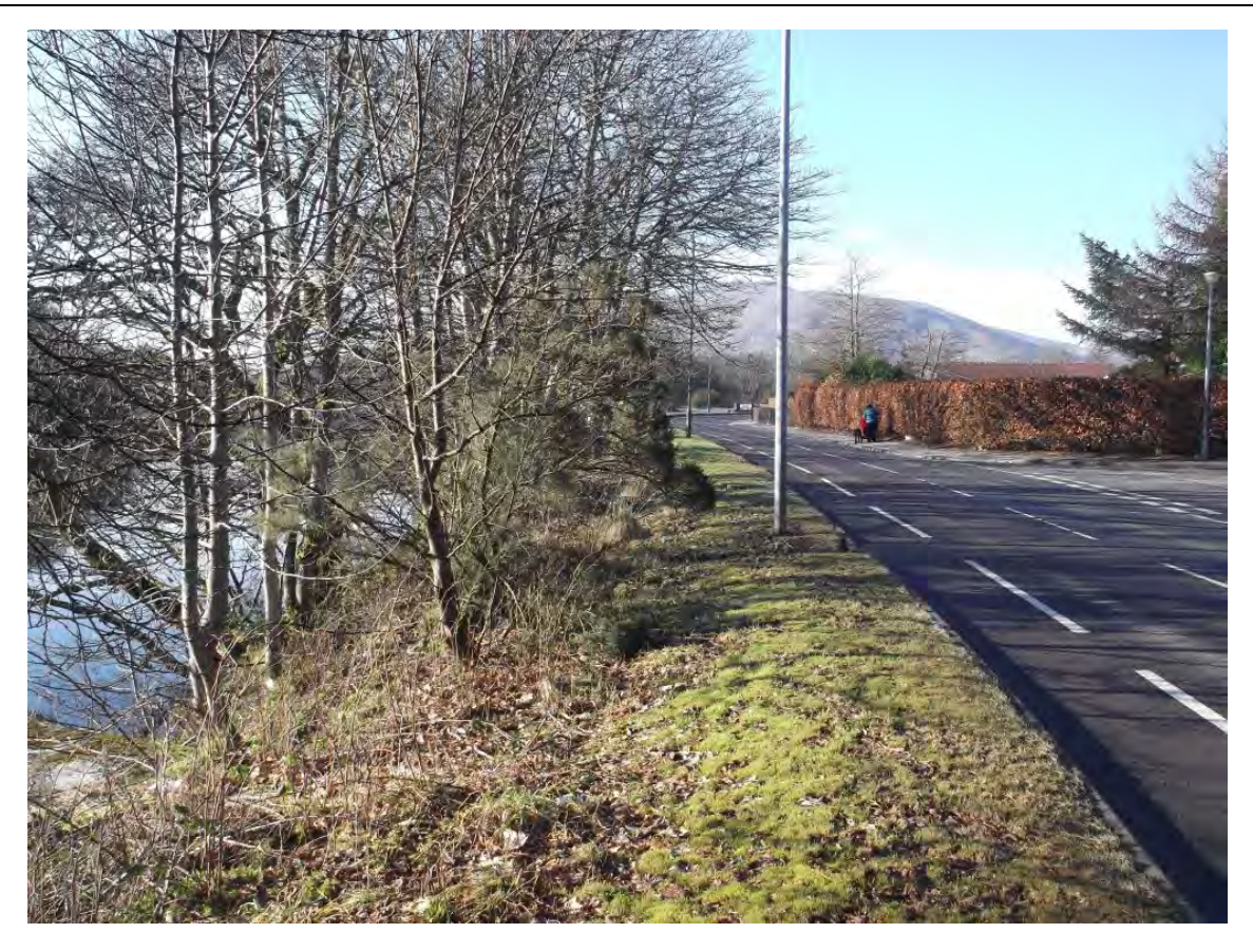
Photo 25 View downstream along west bank of River Lochy, near B8006 and Mossfield Drive

Site Photographs for Marine Licence Application Caol and Lochyside Flood Protection Scheme