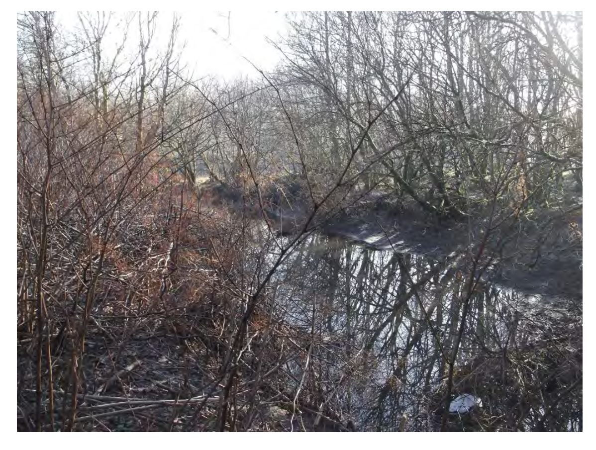
Photo 23 Minor side channel of River Lochy from near to Riverside Cottage on the B8006.