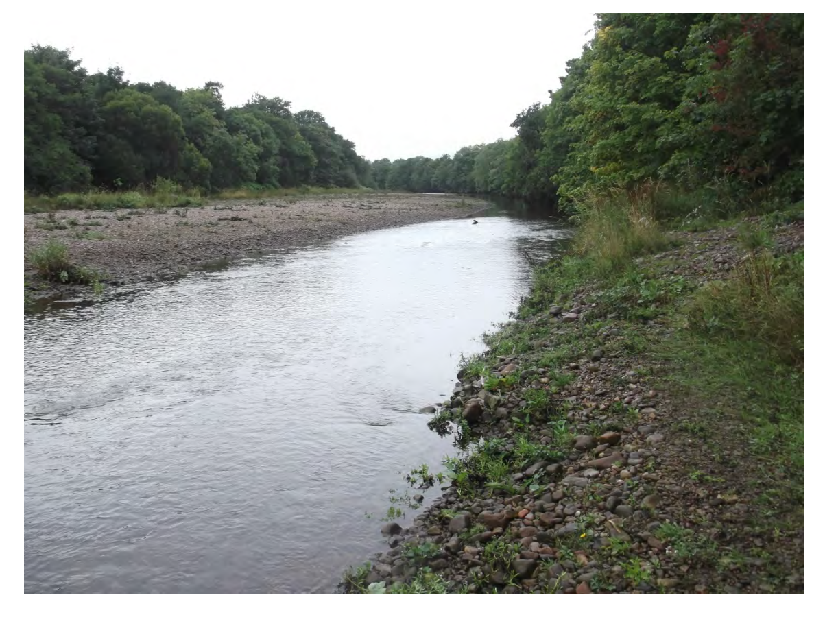
Photo 27 View downstream along west channel of River Lochy, near the former Lochyside RC School.