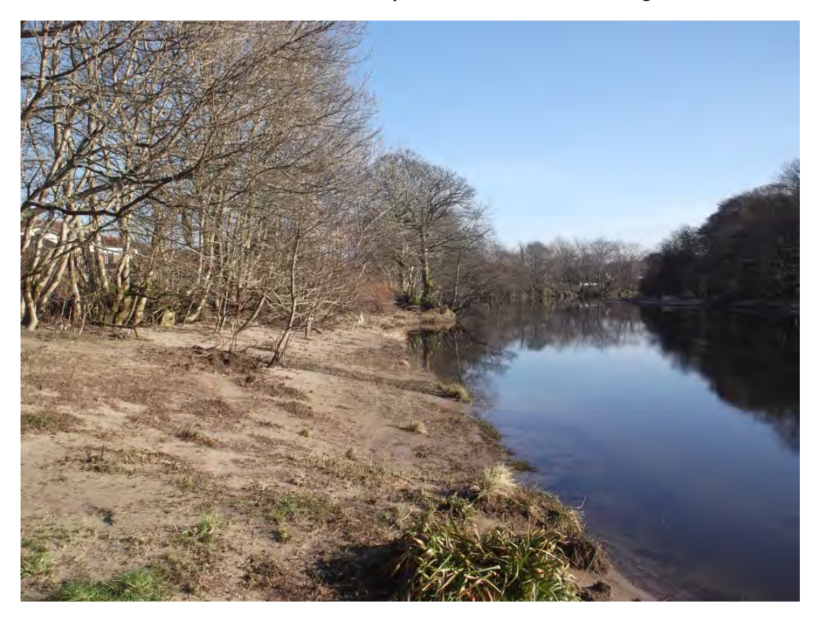
Photo 24 View upstream along west channel of the River Lochy near B8006 and Mossfield Drive.