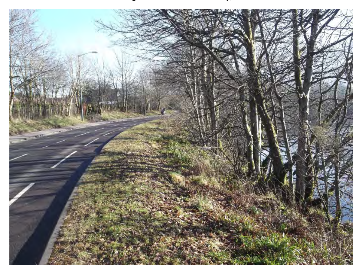
Photo 26 View uptream along west bank of River Lochy, near B8006 and Mossfield Drive

Photo 25 View downstream along west bank of River Lochy, near B8006 and Mossfield Drive