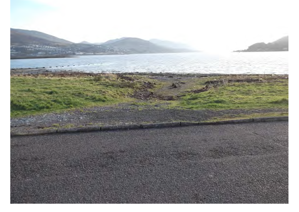
Photo 12 View towards Loch Linnhe from Glenkingie Street at beach access at Caol Primary School.