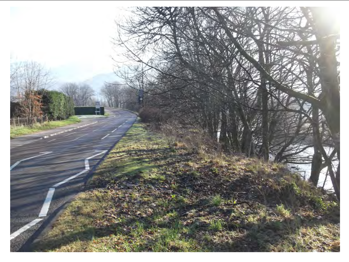
Photo 29 View upstream along the west bank of the River Lochy, near Castle Drive.