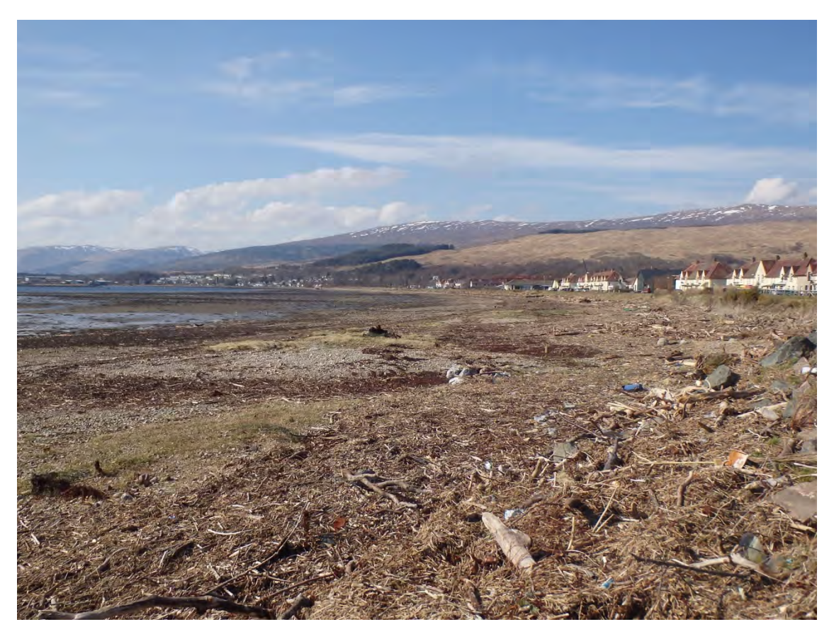
Photo 18 View west along Caol beach from the Caol Waste Water Treatment Works access road.