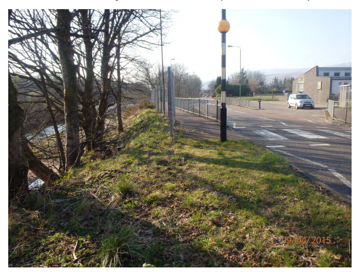
Photo 28 View downstream along west bank of River Lochy, near the former Lochyside RC School.

Photo 27 View downstream along west channel of River Lochy, near the former Lochyside RC School.