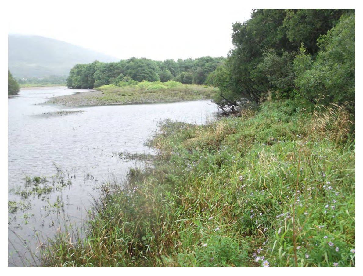
Photo 30 View downstream from west bank of River Lochy, near Soldier's Bridge.