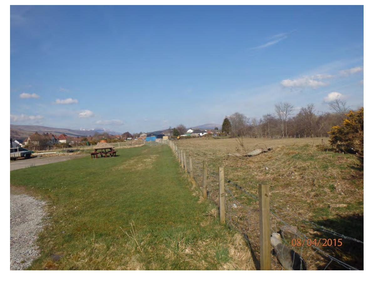
Photo 21 Back of new houses and croft land east of Glenmallie Road.