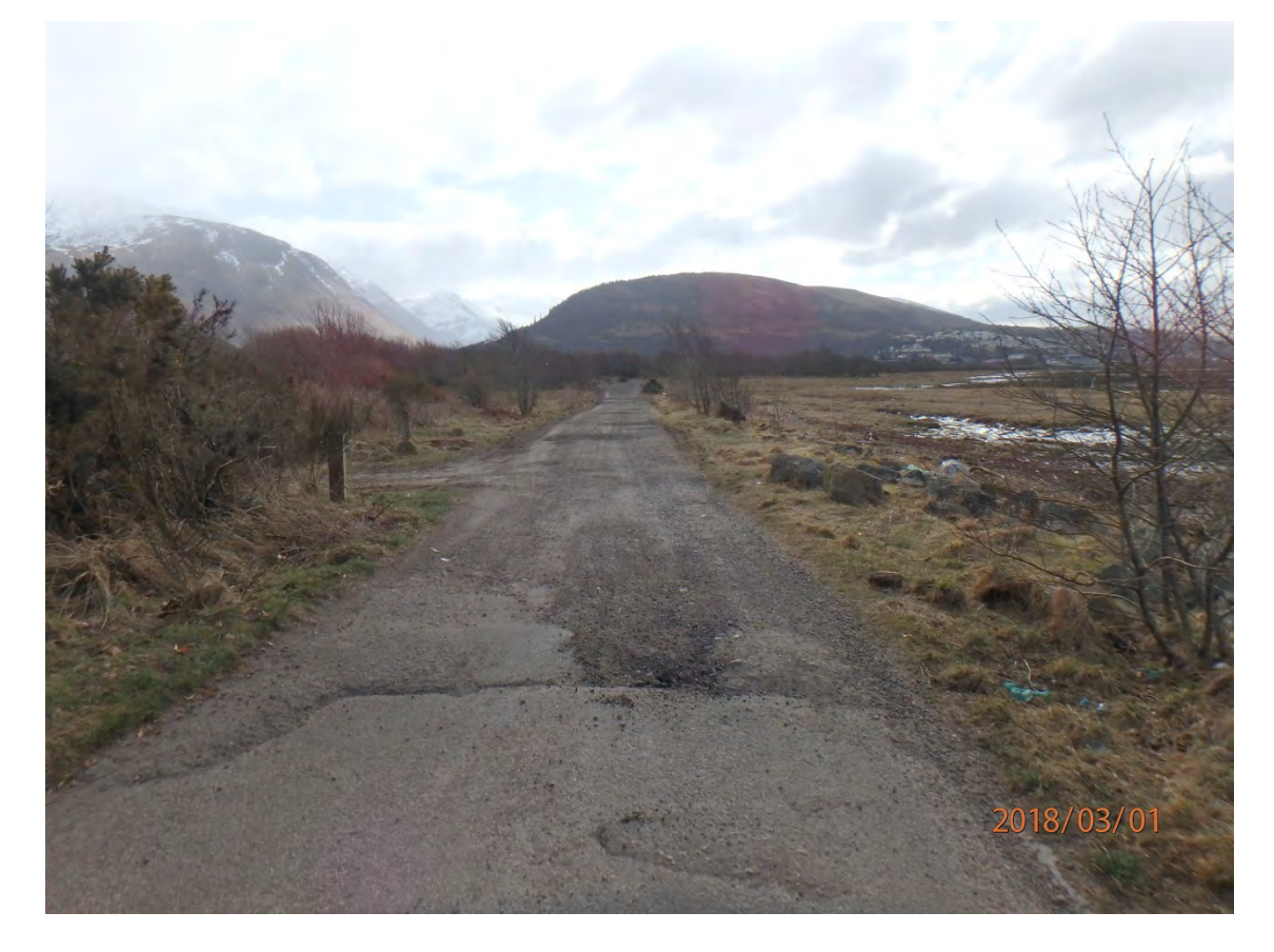
Photo 20 View towards Caol Waste Water Treatment Works along the access road.

Photo 19 View out over Loch Linnhe from the Caol Waste Water Treatment Works access road.