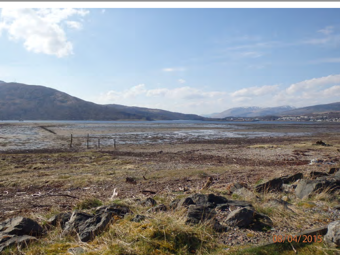
Photo 19 View out over Loch Linnhe from the Caol Waste Water Treatment Works access road.