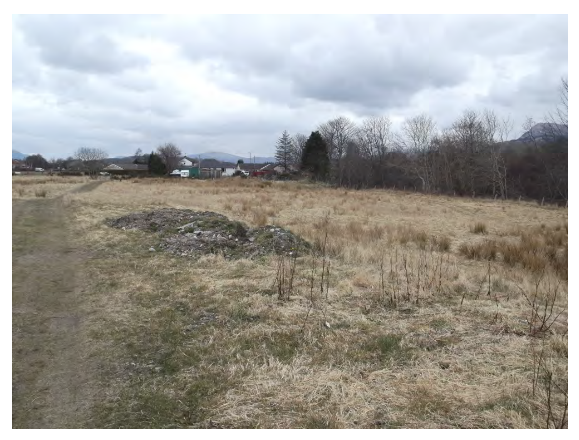
Photo 22 Croft land east of Glenmallie Road and trees on bank of River Lochy.