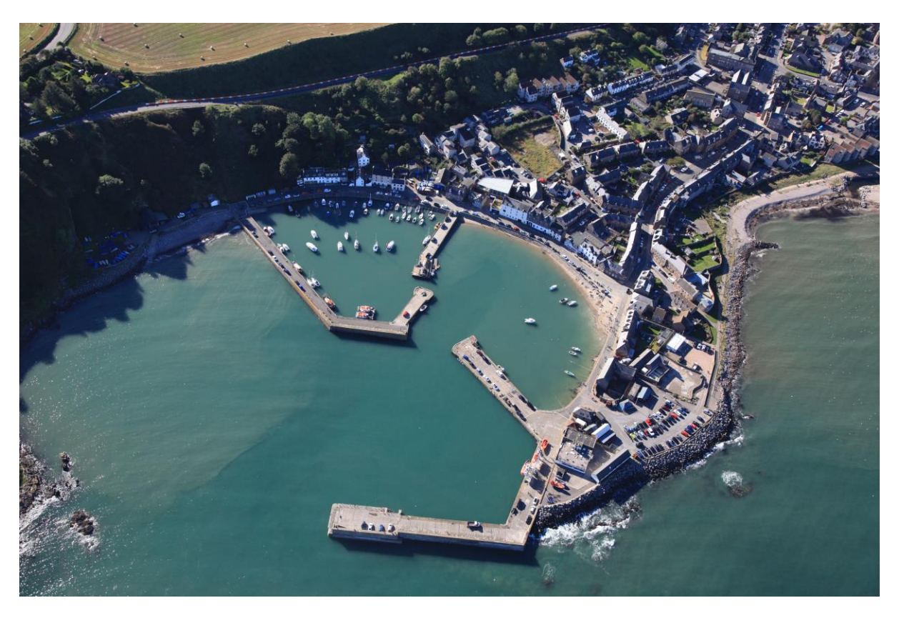
Stonehaven Harbour – Arial View