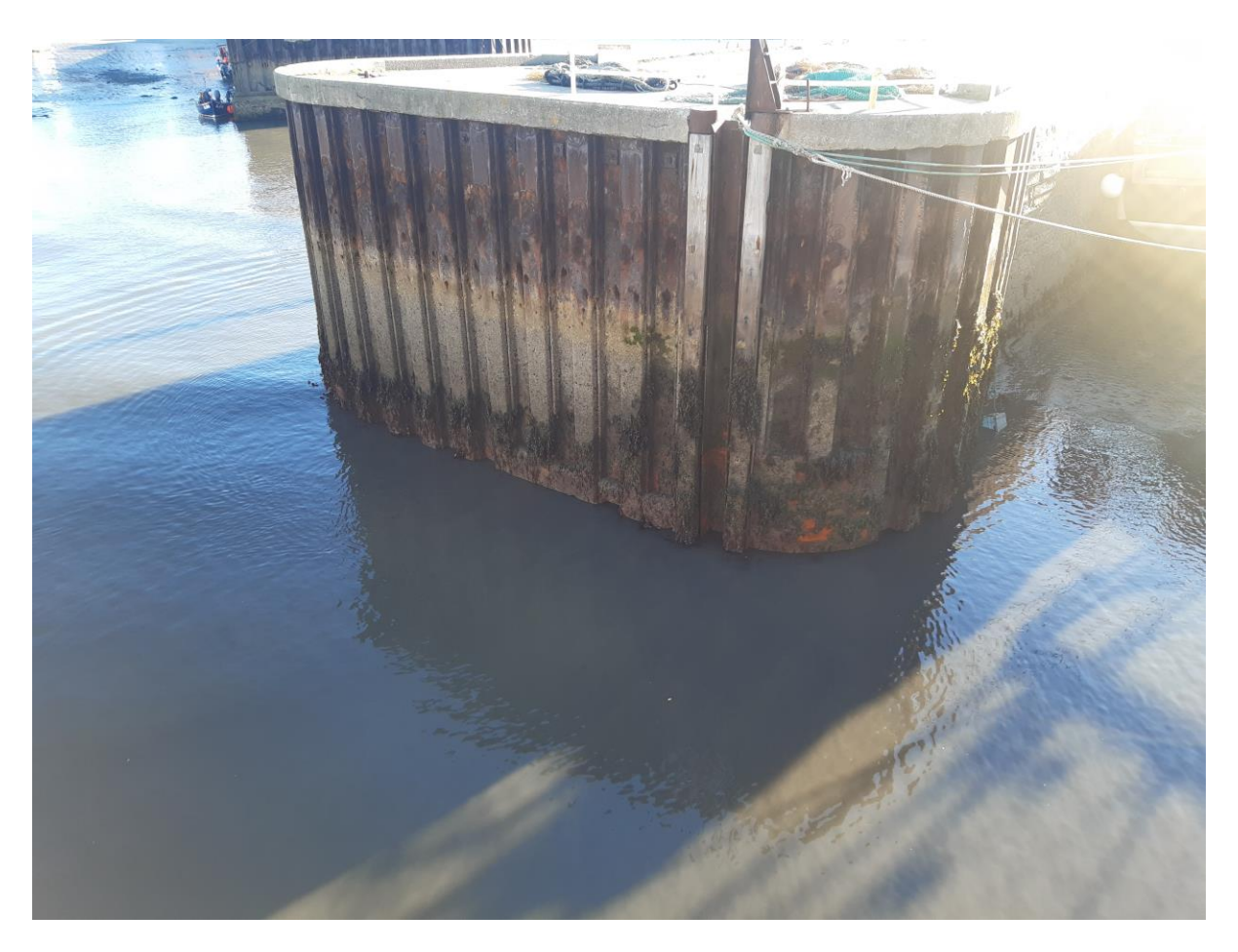
South Pier – Typical Condition