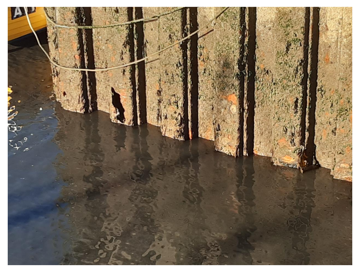
Fish Jetty – Typical Condition