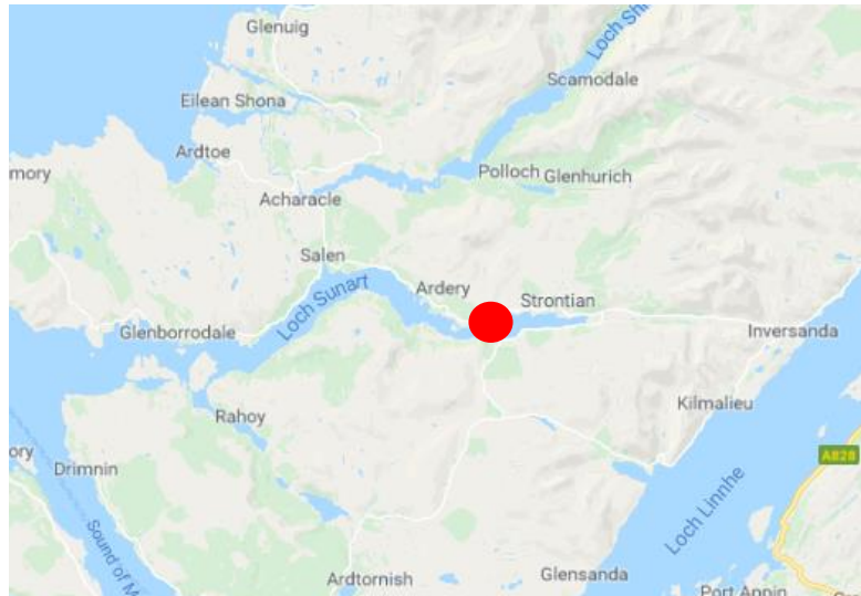
Figure 1 Map showing the location of the site in Loch Sunart.