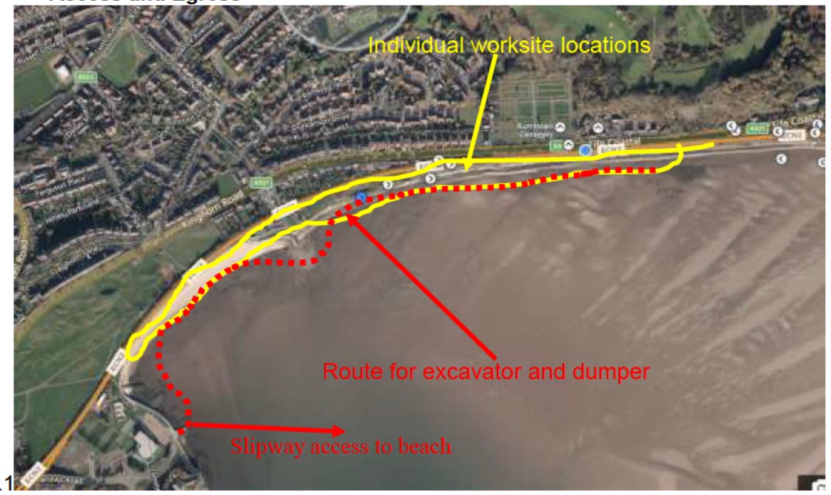
Parking/Access - Kinghorn Main Road at bridge 70 - pedestrians